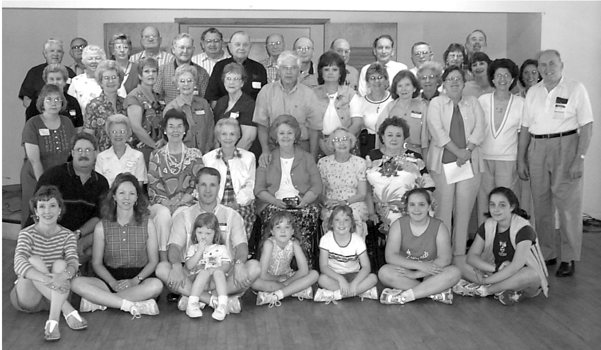
Attendee's to the 2001 Cox reunion in Lampasas, TX